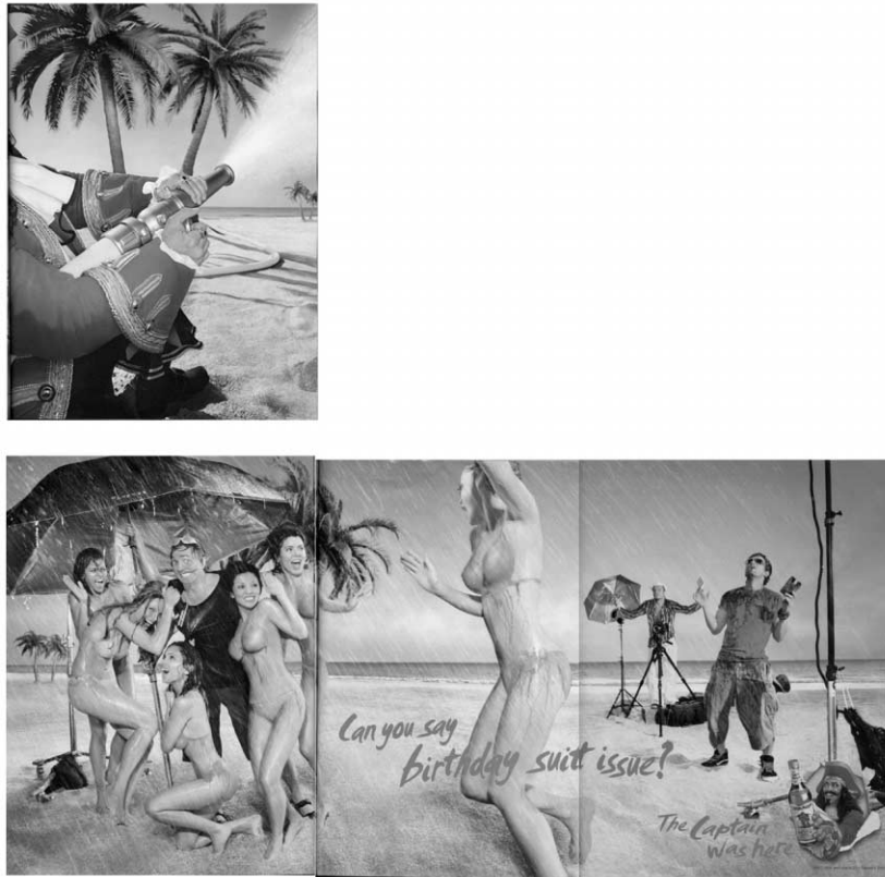
Figure 9 Captain Morgan Rum, “Can you say birthday suit issue?” Sports Illustrated , swimsuit issue, 2003. Color version available as an online enhancement.

enough, the ad suggests. First they arouse men, and then they inevitably make them feel like losers. They deserve to be stripped naked against their will. As in many male rape fantasies, the ad suggests that women ultimately find that they like it. And all of this action is facilitated by a bottle of rum, the Captain’s magical essence.