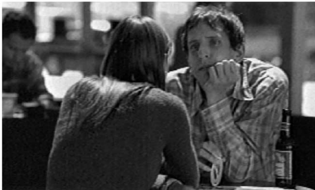
Figure 3 Bud Lite, "Good Listener," Anheuser-Busch, 2003 Super Bowl on ABC. Color version available as an online enhancement.