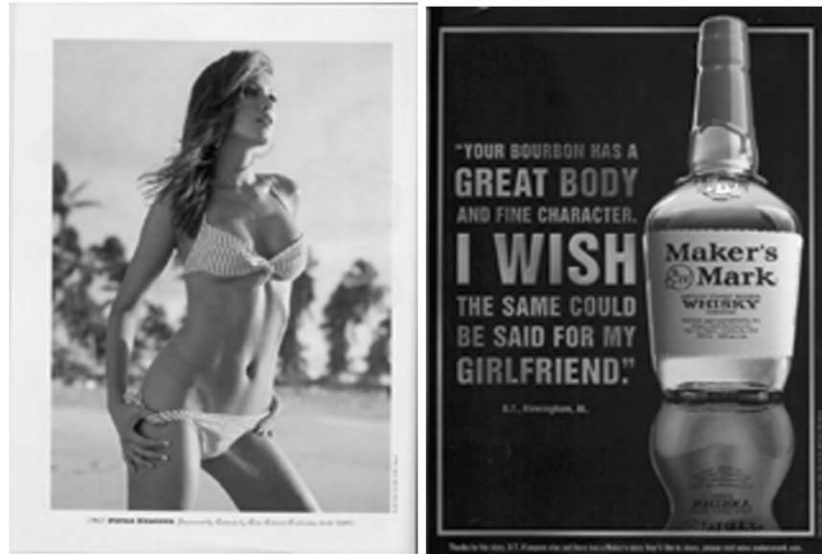
Figure 8 “Great Body,” Sports Illustrated swimsuit model juxtaposed with Maker’s Mark Whiskey ad, Sports Illustrated , swimsuit issue, 2002. Color version available as an online enhancement.