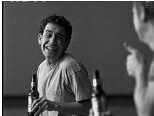
Figure 2 Budweiser, “Yoga Voyeurs,” Anheuser-Busch, 2003 Super Bowl on ABC. Color version available as an online enhancement.