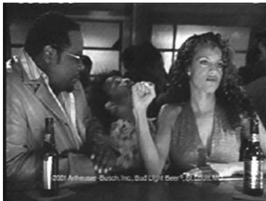
Figure 5 Bud Lite, "Pick-Up Lines," Anheuser-Busch, 2002 Super Bowl on ABC. Color version available as an online enhancement.