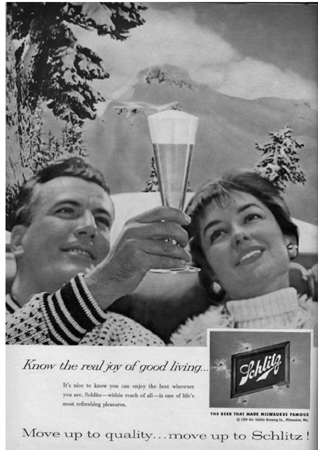
Figure 1 Schlitz Beer, “Good Living,” Sports Illustrated , 1959. Color version available as an online enhancement.

work. These ads told men that “For all you do, this Bud’s for you.” Women were rarely depicted in these ads, except as occasional background props in male-dominated bars (Postman et al. 1987; Wenner 1991; Strate 1992).